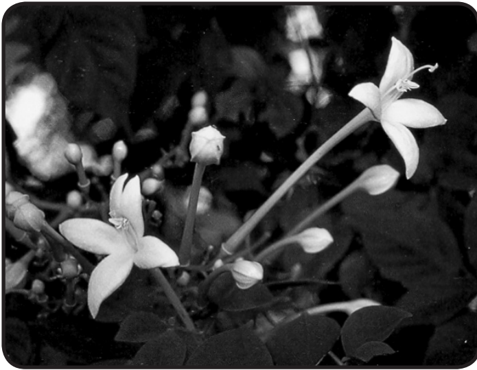
Spiritual significance: Transformation.

and desires and matter is blown out and nothing remains to experience nirvana. It would be more true to state that Nirvana comes down and settles at that particular level of consciousness. Whatever the inaptitude of expressions, there is the path—the eightfold path—that Buddha suggested for one's liberation.